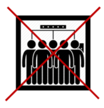
Only persons from the same household or support bubble should travel in lifts together