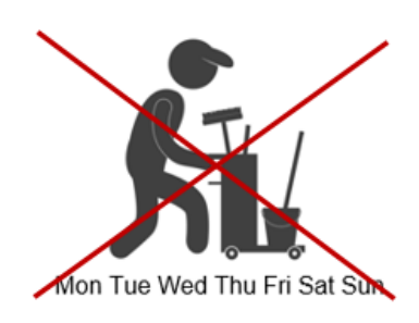
Be aware that common areas of the building are not subject to daily cleaning or disinfection