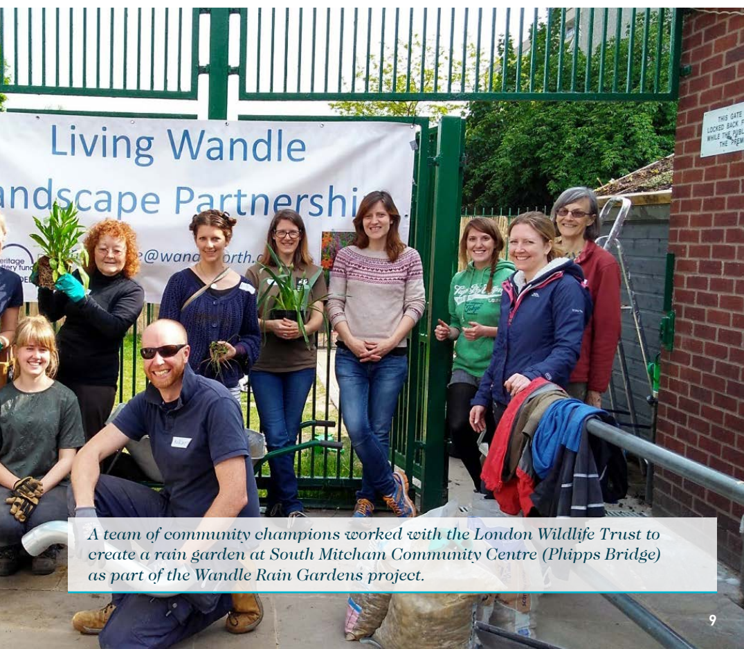
A team of community champions worked with the London Wildlife Trust to create a rain garden at South Mitcham Community Centre (Phipps Bridge) as part of the Wandle Rain Gardens project.

As a Community Champion you will be trained by Sustainable Merton on a range of issues, including air quality, energy and waste, and will learn and develop skills while making a difference in your community.