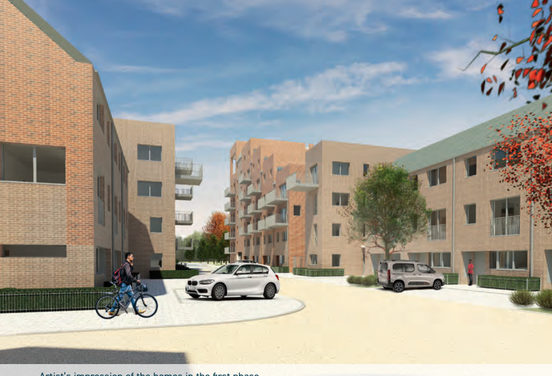
Artist's impression of the homes in the first phase